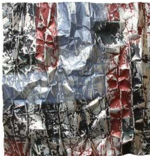
Rumple, 2013. Acrylic on galvanised metal, 46" x 47"

In the sculpture "weigh before you act" I am saying, look before you leap. Look at the details. If you don't you will miss a lot of things. With maturity I have learnt that you need to take your time and look at details to avoid making mistakes. That is important on the personal as well as the macro level – our leaders need to look more at the details. In life we need to take our time and see beyond the obvious.