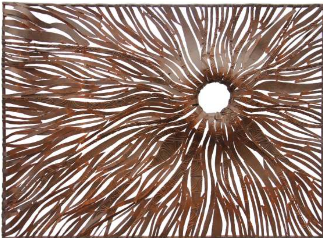
The Source , 2012, Metal - 54" x 72"

I wish every man would only look within himself. Water, air, plants, earth, fire, and events happening around me are major tools and inspirations that shape my ideas. We should not forget that the world is a global village in which we all live; the things happening across the world are at everyone's finger tips as soon as they occur.