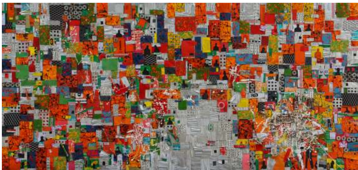
Scavengers - 2013, mixed media, 96" x 44"

I am STILL unflinchingly committed to my desire for adventure. Still seeking and configuring media for the dramatic and dynamic surprises they bring to my surfaces. I am STILL thrilled by the dynamic effects created by accumulative patterns and fragmented forms. This helps to stabilize my art.