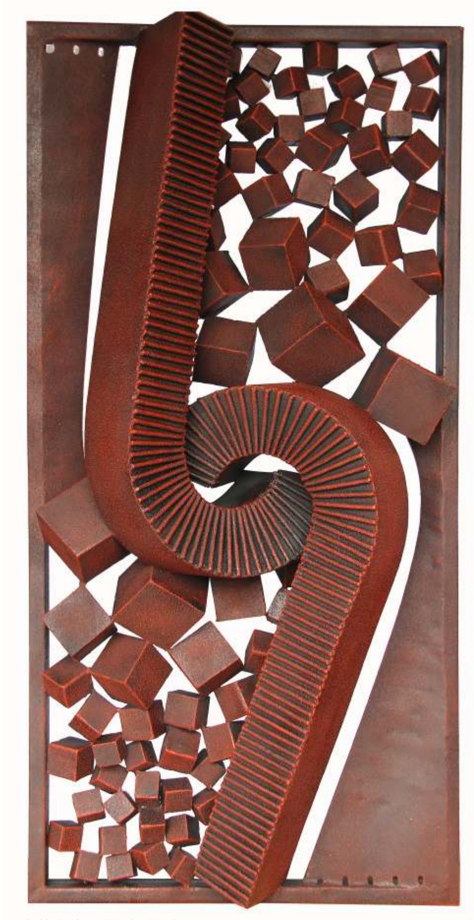
Positive Result , 2013, Metal - 55" x 26"