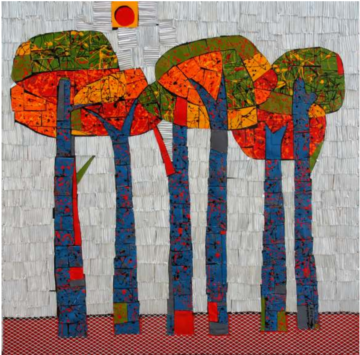
Copse 3 - 2013, mixed media, 48" x 48"