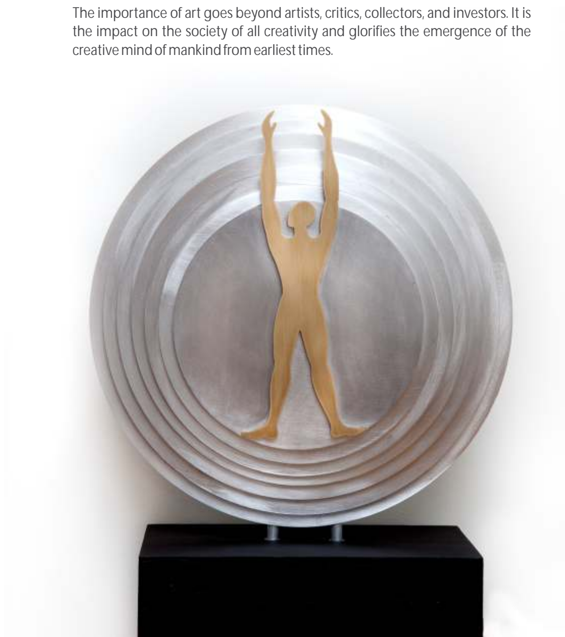
Homage IV - 2011 Aluminium and Brass 14" diameter

The importance of art goes beyond artists, critics, collectors, and investors. It is the impact on the society of all creativity and glorifies the emergence of the creative mind of mankind from earliest times.