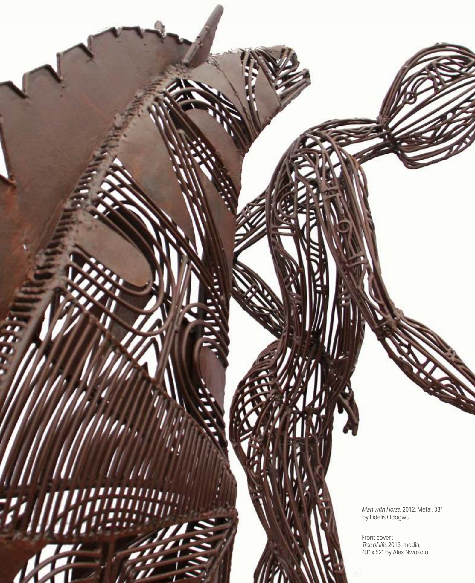
Man with Horse , 2012, Metal, 33" by Fidelis Odogwu