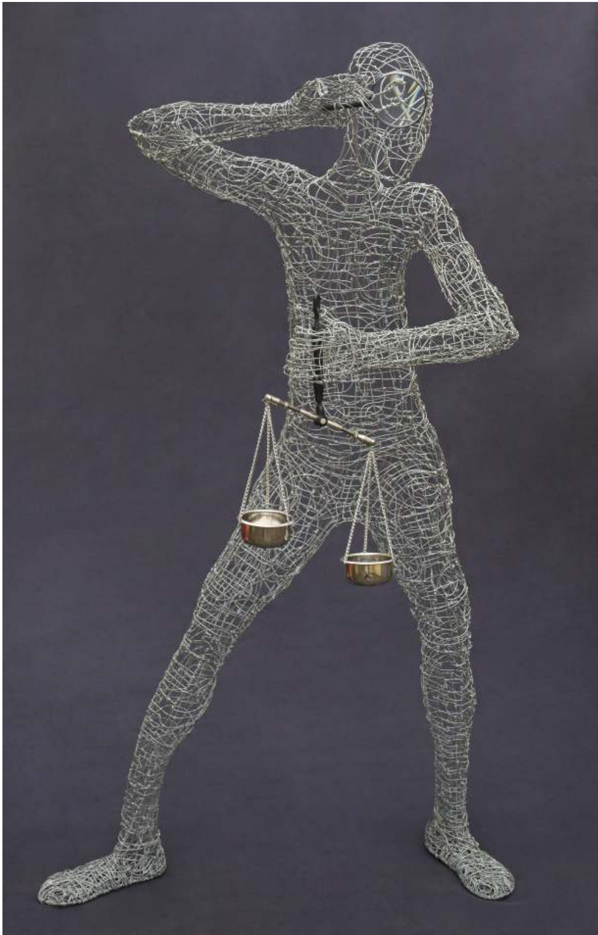
Weigh before you act , 2013. Height - 5.5ft. - Wire, Magnifying Glass and Beam Balance