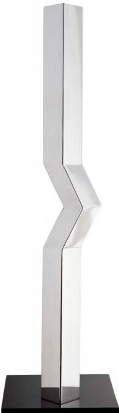
Divergence - 2009, Polished Stainless Steel, 40" x 5" x 5"

Two of his designs were featured in the Global Africa Project, a major exhibition at the Museum of Arts and Design in New York from Nov. 2010 to May 2011. He spends his time creating sculptures at his studio in the Hamptons, New York state.