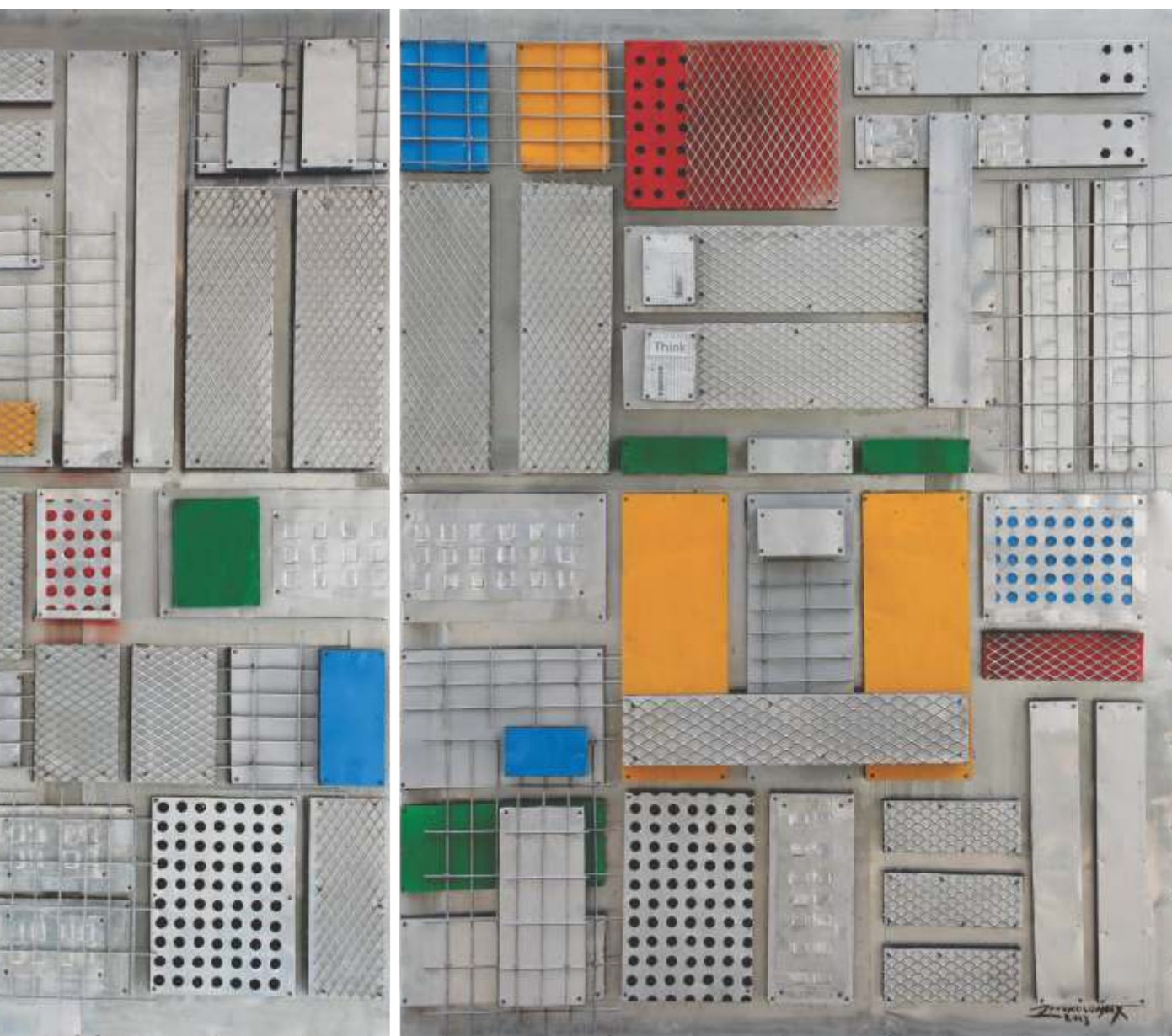
Urban project , 2013, mixed media, 109" x 48" by Alex Nwokolo